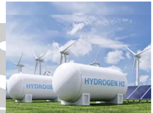
large-scale production or utilization of Hydrogen as Green Hydrogen Hubs.