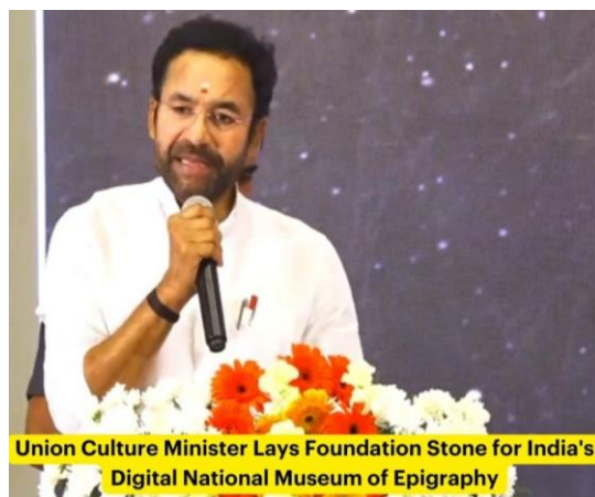
Union Culture Minister Lays Foundation Stone for India's Digital National Museum of Epigraphy